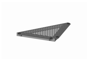
Waveguide Bridge Corner Filler, 90°