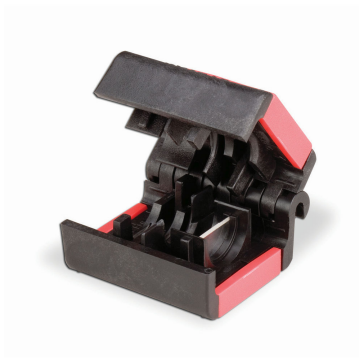
EASIAx® Manual Cable Preparation Tool for 7/8 in coaxial cable