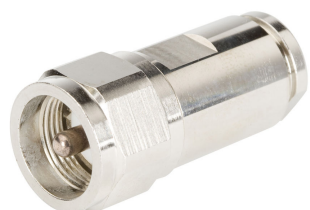
UHF Male for CNT-400 braided cable