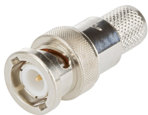
BNC Male for CNT-400 braided cable