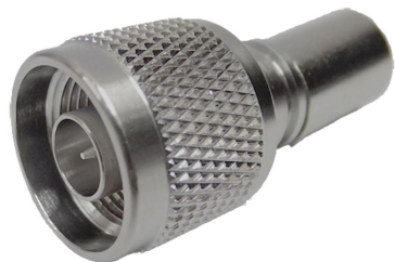
Type N Male for CNT-400 braided cable