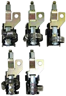
Mini-OTE 300-Series, Optical Terminal Pole Cable Retention Kit