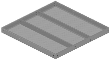
Equipment Platform, 10 ft x 10 ft, base only